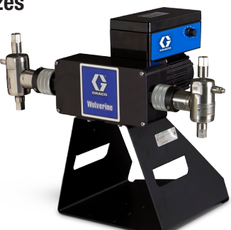
Wolverine Variable Speed Pump